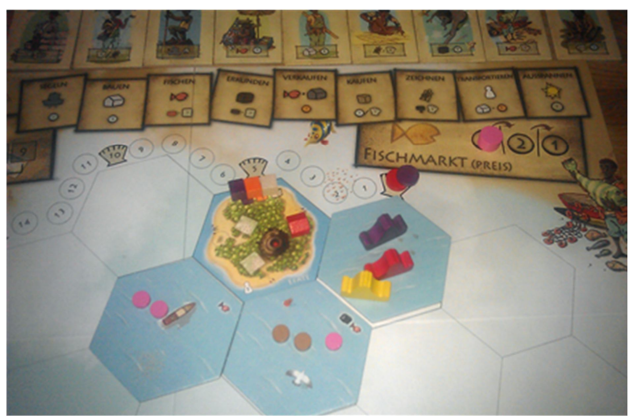
Starting a game: Red's already built a stall

use to track victory points scored as the game goes on. A lot of points can be scored at the end of the game, so this isn't necessarily an indicator of who's winning.