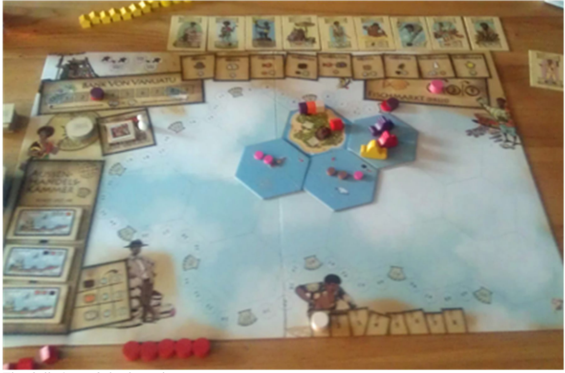
The full view of the board

When you take an action, you remove your markers and carry out whatever the action lets you do, paying any costs and receiving any rewards. If you can't meet the requirements of the action, you don't get to do it. Similarly, if you are not top in any action, you have to remove your marker(s) from a box and do nothing. Once you've removed your marker(s), the player who now has the highest bid for that action can take it in their turn.