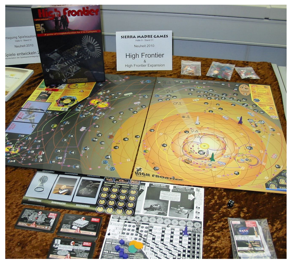
High Frontier and expansion on display at Spiel '10

Having an extra-terrestrial Factory makes a huge difference as you can now make things in outer space. This is represented by using the other side of a card—the front face is black print on white, the reverse is white print on black. Black cards are highly efficient Thrusters, very effective Robonauts (some have