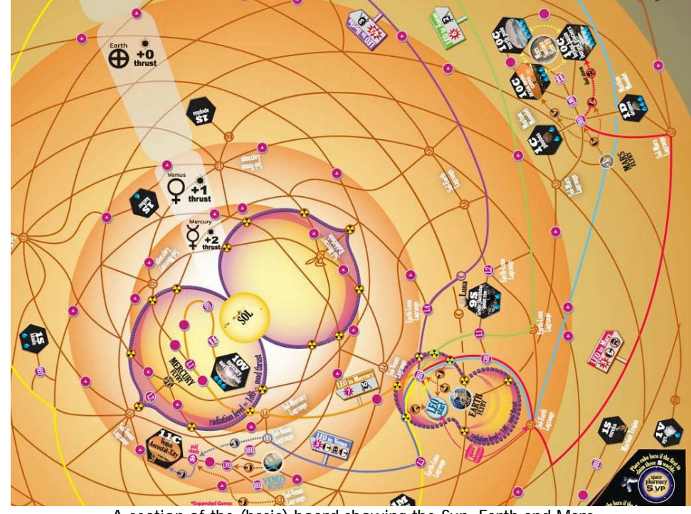
A section of the (basic) board showing the Sun, Earth and Mars Coloured lines are optimum routes—the red one is Earth-Mars

'Robonauts' make up the second set of cards. These are rated for "in-situ resource utilisation" (ISRU). That is, how easy it is to prospect (for valuable minerals) once you've landed somewhere. The lower the rating the better. There are three types of Robonaut, each providing a bonus. The third set of cards is Refineries. These do nothing in themselves, but getting a Robonaut and Refinery to the same place lets you set up an extra-terrestrial Factory. Each Factory is a victory point (and counts towards ending the game), but is more valuable for the equipment it can produce: better Thrusters and Robonauts than can be built on Earth.