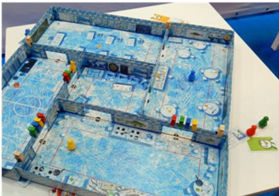
Ice Cool set up and being demonstrated