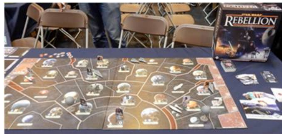
A demo game of Star Wars: Rebellion all prepared, Death Stars at the ready...

You play enough rounds for everybody to be Hall Monitor once and then tot up the points to see who’s won. Never mind that, I think this is a game to play just for the fun of it. The penguin pieces are actually quite tricky to flick, so you have to learn the knack – though part of the fun is watching pieces bouncing off the walls. It’s aimed at children and families, but it is good fun. On first acquaintance, I give it a provisional 7/10 on my highly subjective scale. Find out more at www.brain-games.com