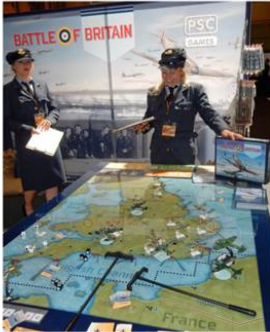
Battle of Britain on a large scale

points, the game's currency, which are used to buy equipment cards and 'impact' cards which establish the player's reputation. From what I saw, the game plays pretty quickly and is good fun – it was certainly going down well with the people I watched. An entertaining lightweight game, I think: I give it a provisional 7/10 on my highly subjective scale. The game was successfully funded on Kickstarter at the beginning of July and is planned for delivery early in 2017. It can be ordered from the website: www.lab-wars.com