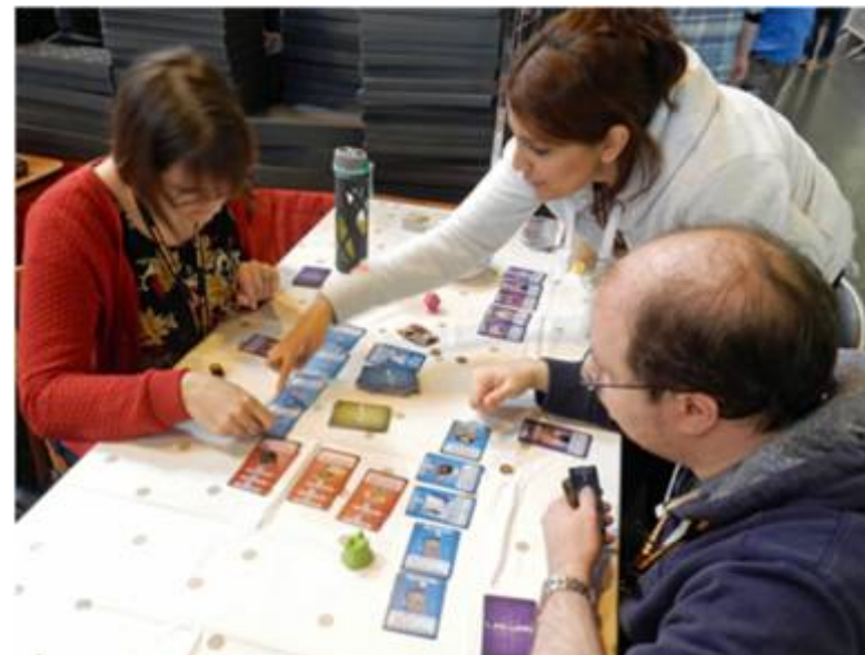
Lab Wars being demonstrated

The game is played over five seasons, so players can't rest on their laurels if they do well in the first season. The first thing players have to do is buy in better shows. Then they can recruit stars for those