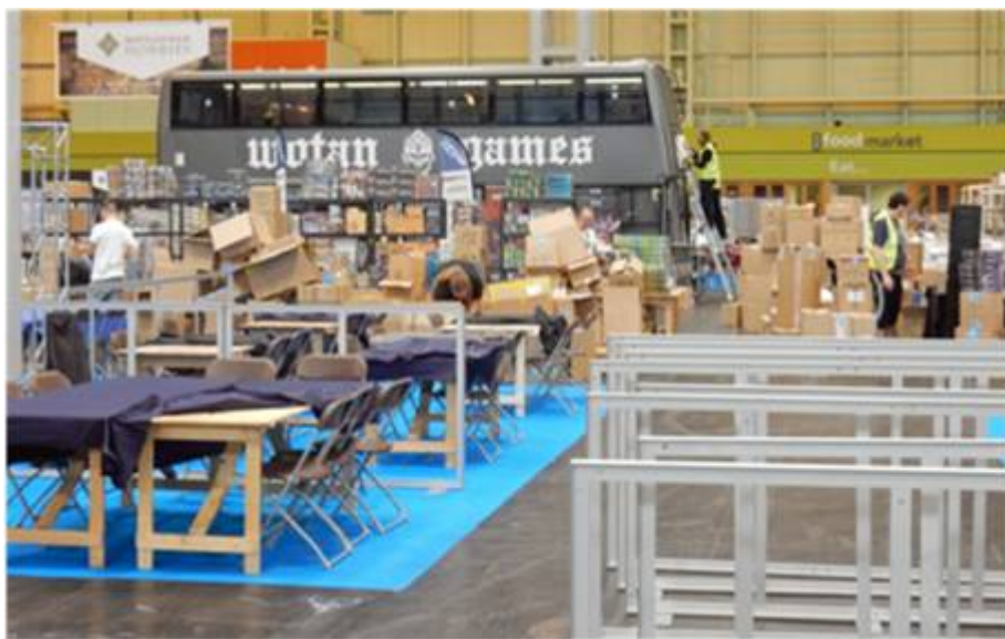
Setting up at the Expo – Wotan have cheated by just driving a bus in!

The Expo has also expanded to three days, opening (late) on Friday morning and running through the whole weekend. This, of course, means that gamers were in situ from Thursday even though there were no formal events until Friday. I rolled up for Thursday lunchtime as, with my retailer hat on (as Games from Pevans ), I had an invitation to Esdevium Games's "Retailers' Summit". Hosted by