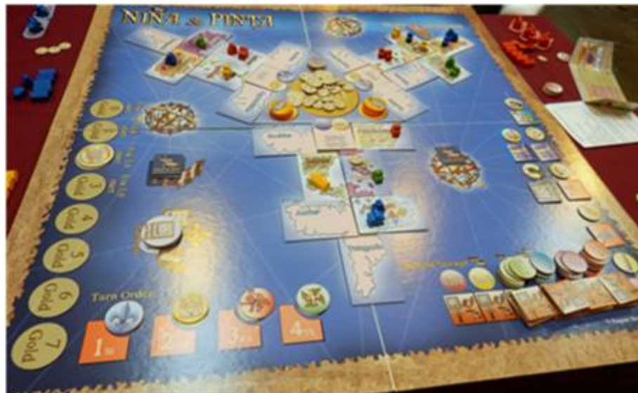
Playing Niña & Pinta

immediate advantages (such as a free town or larger ships). The others score points according to the number of cities in the appropriate New World (just which one is established during play – something else for players to think about).