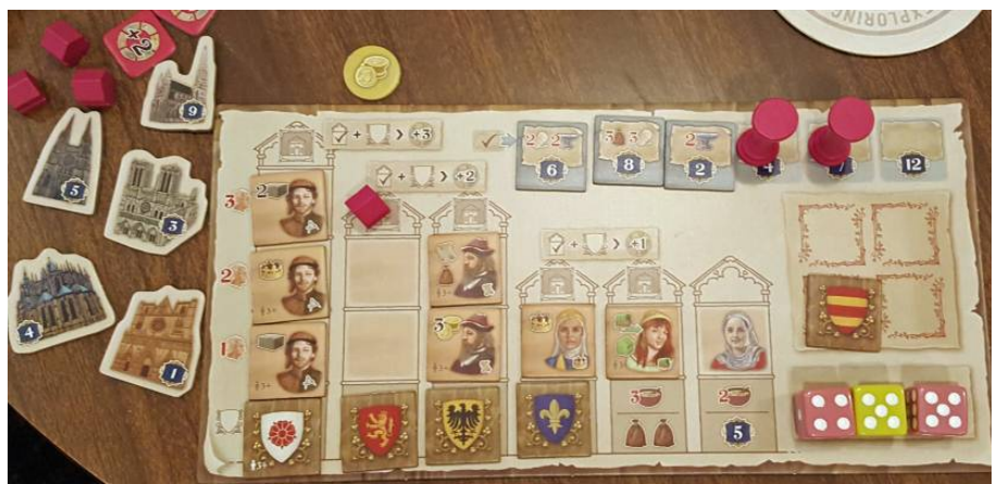
My player board at the end of a game – lots of Crests, three completed buildings and the dice I used this round (lots of food and some gold). I've completed three Contracts (top right) and contributed to five cathedrals (off to the left).

On to those Crests. These represent European noble families and can turn up as Bonus or Contract tiles. At the bottom of each building on your player board is a space for a Crest. This costs Food to place and provide a one-off reward. The most expensive Crests, for example, let you place a house or pillar in any city. (I find this particularly useful for getting to London. While several cities are dead ends on the road network, London is the longest cul-de-sac, making it awkward to get to – and back from.)