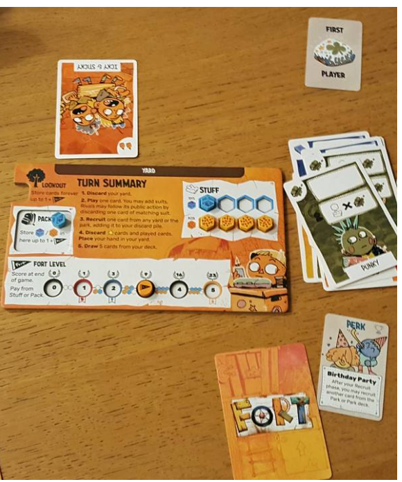
Here's my board mid-game. Lots of pizza! And my fort is up to level 3. Note the two actions (white rectangles) on the discarded card - though the public (upper) action is blank. The card in my Yard has no actions.

A player's turn, then, starts with discarding cards in their Yard and then playing a card from hand. They may boost it with other cards of the same suit before taking one or two of the actions shown. Any followers do their action before the player on turn drafts a card from the 'Park' (a row of cards laid out at the start and replenished when taken), the deck or another player's Yard. Played cards and