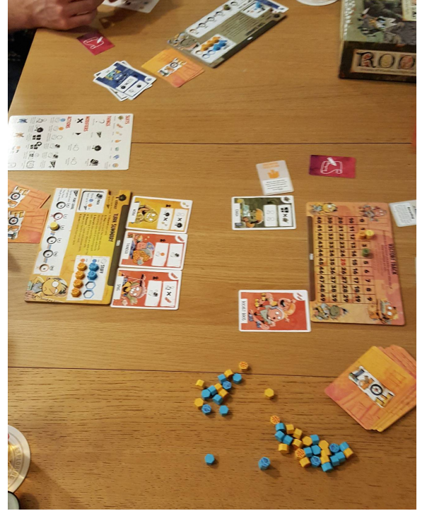
Fort in play (yes, that's Root in the background)

when deciding what to play. You can also beef up the action by playing additional cards of the same suit (followers can't).