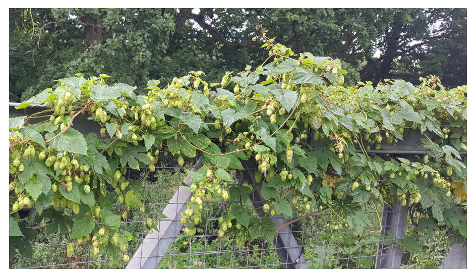
I don't think I've come across wild hops before, though I do remember the hop field that was visible from the bus on my way to school in my teenage years.

My latest excursion along the River (river!) Pinn revealed some familiar looking flowers on the climbing plant festooning the new bridge over the river: hops!