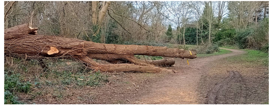
Tree gone! And so has the sun.

A week later, I walked the same route and council workers had clearly been busy.