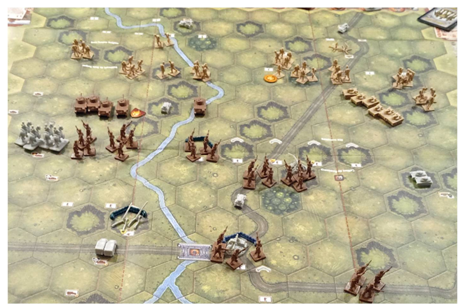
Note the Russian cavalry poised on the left while the Big Guns have zeroed in on a Japanese unit in the centre.

for Tom's Japanese 8:10 after a good fight. At a couple of hours playing time, this is clearly a meatier scenario. And the aggregate score is with me 18:14.