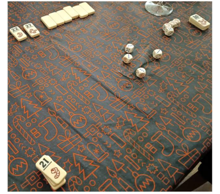
Yes, we've all gone bust a few times.

Our finale (it's getting late!) was Pit . It lacks a bit with only three players, but I think we were boisterous enough to make up. (There's usually an intervention to insist we close the door to keep the noise down even when it's already closed.)