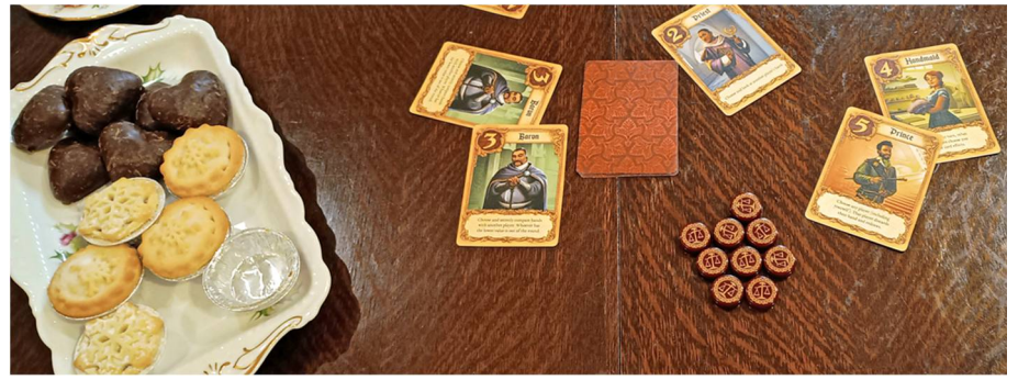
Love Letter, mince pies and lebkuchen

This table shows the Colonels of the Frontier regiments ("N" + MA for NPCs). together with the volunteers assigned for the season.