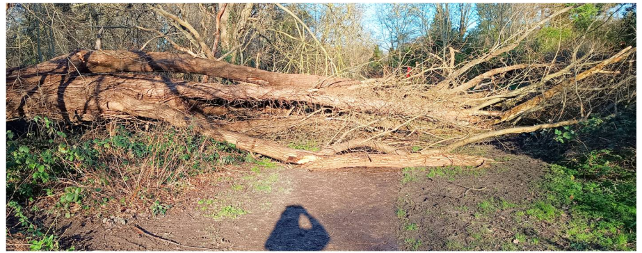
Tree down! Walkers were able to work their way round the end (or clamber over). Note the length of my shadow - this is at noon.

Tramping alongside the River (!) Pinn after the heavy rainfall early in January, my path was blocked.