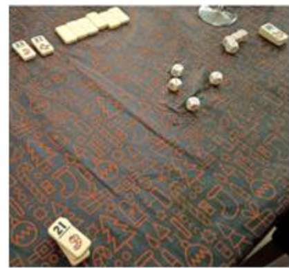
Yes, we've all gone bust a few times.

Our finale (it's getting late!) was Pit . It lacks a bit with only three players, but I think we were boisterous enough to make up. (There's usually an intervention to insist we close the door to keep the noise down even when it's already closed.)