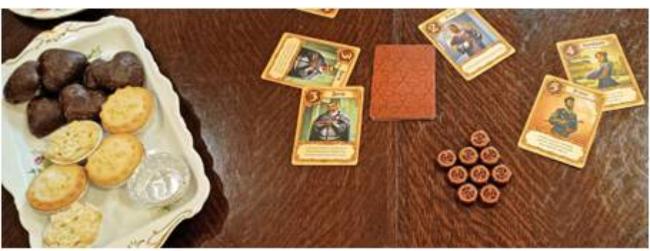
Love Letter, mince pies and lebkuchen

I published last issue (TWJO 240) on 21st December and the PDFs were downloaded 107 times by the end of the month (and year). The PDFs of issue 239 attracted 73 downloads in December to make 161 in 6 weeks or so. And TWJO 238 was downloaded 51 times through the month, taking it to 190 since publication.