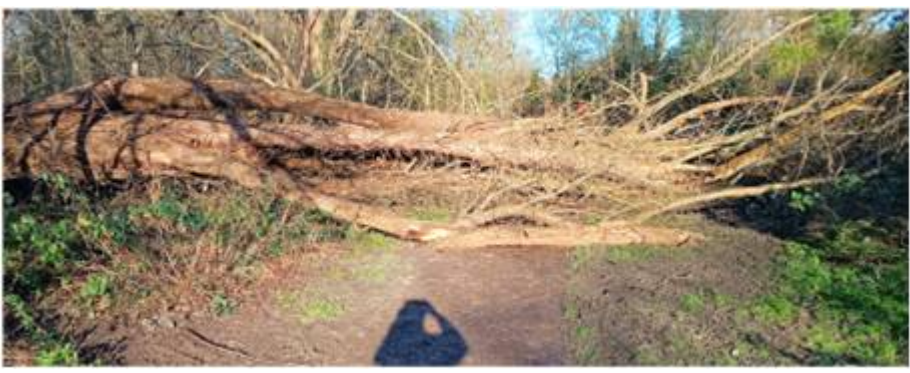
Tree down! Walkers were able to work their way round the end (or clamber over). Note the length of my shadow – this is at noon.

Tramping alongside the River (!) Pinn after the heavy rainfall early in January, my path was blocked.