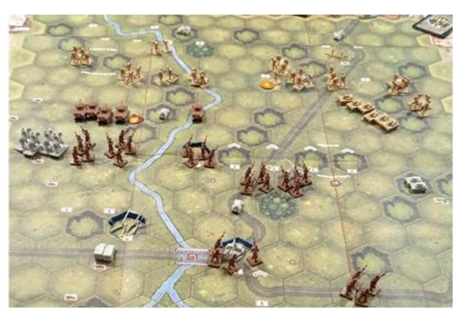
Note the Russian cavalry poised on the left while the Big Guns have zeroed in on a Japanese unit in the centre.

Christmas games TWJO 241 Jan-Feb 2024 TWJO 241 Jan-Feb 2024 Letters