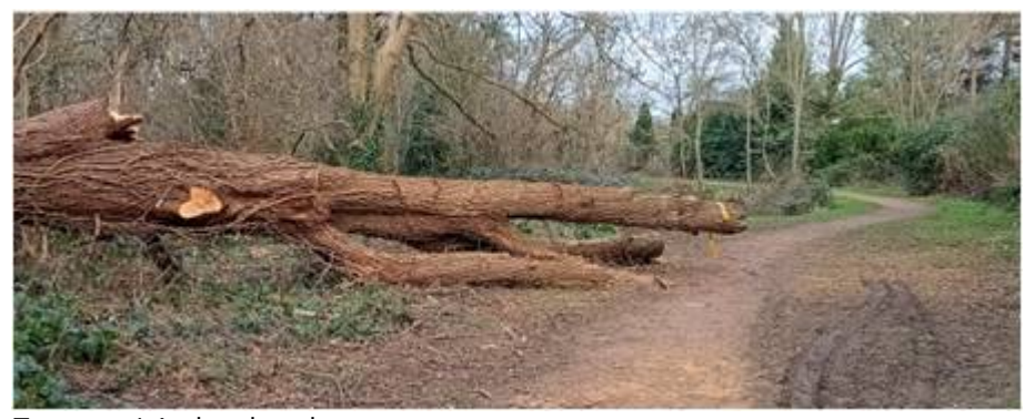
Tree gone! And so has the sun.

A week later, I walked the same route and council workers had clearly been busy.