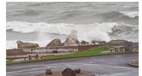
The Ballygally 'bear' weathers the storm. No, I'm not tempted to go surfing - I'd spill my Guinness!

Other things visible are swimmers (some of them sensibly wearing