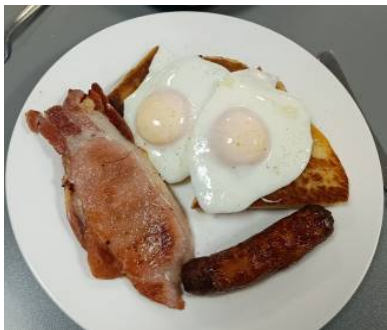
The iconic Ulster Fry. Or breakfast. This is a small one (though with an extra egg).

occasional gannet patrolling the bay, but we assume there weren't any fish to be had as we didn't see any of them dive. Other birds spotted include cormorants, crows, oyster catchers on the beach and the pied wagtails that enthusiastically poke about the grass cuttings after the lawn's been mowed.