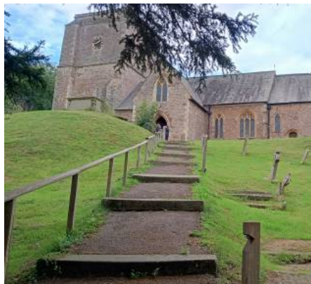
Yes, it really is that steep!

Dad was helping a local priest officiate at the funeral (he'll take any opportunity to dress up and perform Christian – Anglican, specifically – ritual), so we arrived early to scout out the lie of the land at the church (it's a steep walk up from the road with a view to the River Severn).